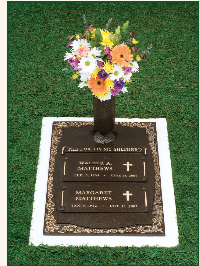
METROPOLITAN LEDGER 18" x 27"